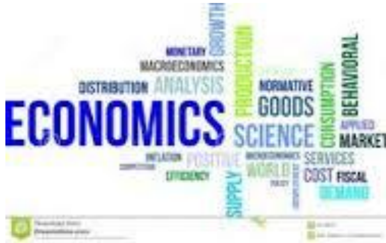
TABLE OF CONTENTS–MAY 2018